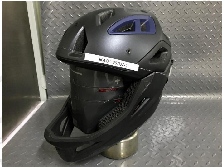
904.06126.007 – LT1701-MTB ENDURO 3.0 (Multi)